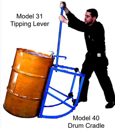
Model 31 Tipping Lever