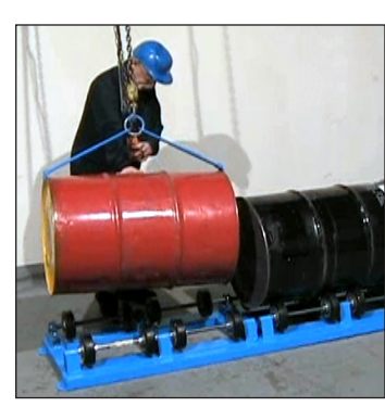
Use your hoist or crane and Morse model 41 Drum Lifting Hook to load drums onto the drum roller.