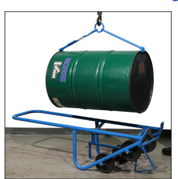
Get a drum horizontal with Morse model 160 4-Wheel Drum Truck. Then lift it with Morse model 41 Drum Lifting Hook.