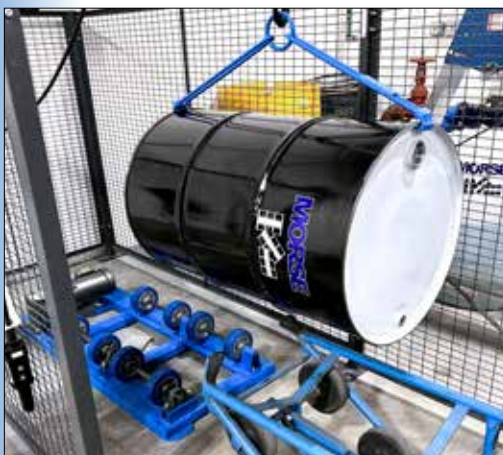
Lift and place horizontal drum onto with your hoist

WARNING: Do NOT attempt to lift an UPRIGHT drum with these devices