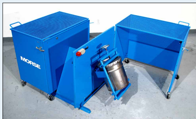
Guard Enclosure shown installed with Double Can Tumbler (Can Tumbler sold separately).

Install all Morse Can Tumblers and drum rotators in accordance with OSHA requirements for enclosure with interlock, etc. For OSHA compliance, see OSHA subpart O.1910.212(a)(4) “Barrels, containers, and drums. Revolving drums, barrels, and containers shall be guarded by an enclosure which is interlocked with the drive mechanism, so that the barrel, drum, or container cannot revolve unless the guard enclosure is in place.”