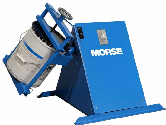
Single Can Tumblers rotate one can “corner-over-corner”