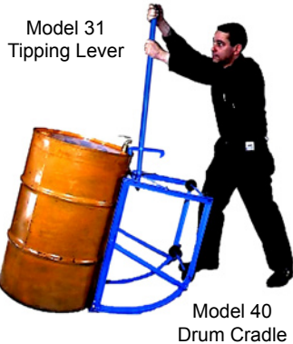
Model 31 Tipping Lever