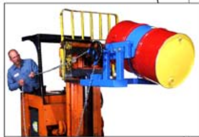
MORStop Tilt-Brake on model 285A Forklift-Karrier