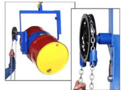
MORStop Tilt-Brake on model 185A Kontrol-Karrier

Below Hook Kontrol-Karriers with chain wheel tilt control, or with hand crank or hand wheel manual tilt control option (shown right on Model 185A).