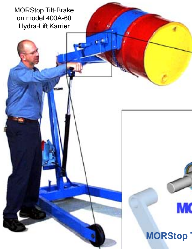
MORStop Tilt-Brake on model 400A-60 Hydra-Lift Karrier