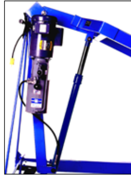
Electric Power Lift Option #120

Use switch to raise the drum. Lower the drum with manual release valve.