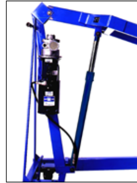
Air Motor Power Lift Option #124

Use switch to raise the drum. Lower the drum with manual release valve.