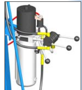
Battery Power Lift & Tilt Option #115

Similar to Option 124 above, except with a second valve controlling the hydraulically driven drum tilt.