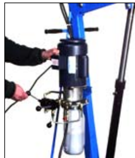
Electric Power Lift & Tilt Option #110

Similar to Option 120 above, except with a second valve controlling the hydraulically driven drum tilt.