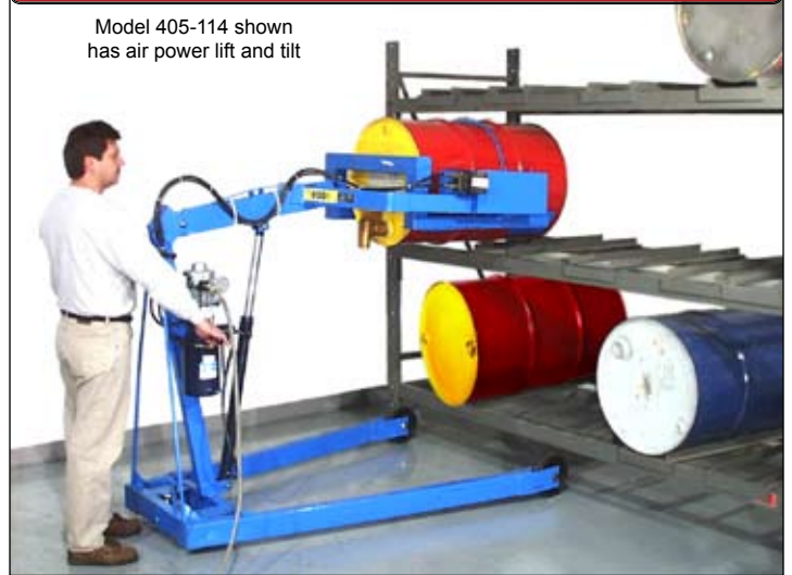
Model 405-114 shown has air power lift and tilt