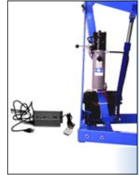
Battery Power Lift Option #125

Use on/off valve * to raise the drum. Lower the drum with manual release valve.