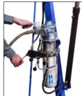
Air Power Lift & Tilt Option #114

Similar to Option 120 above, except with a second valve controlling the hydraulically driven drum tilt.