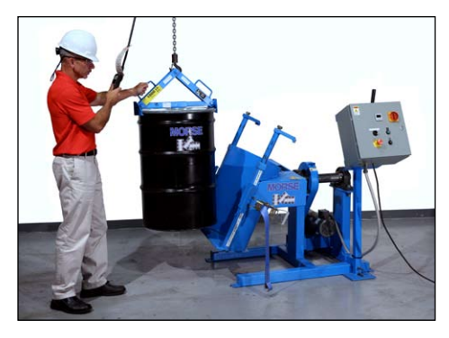
Load drum with hoist using appropriate drum lifting equipment, such as model <u>92 Below-Hook Drum Lifter</u>.

1. Swing the hinged ratchet plate clear of the drum opening. Loosen the top clamps to the full open position.