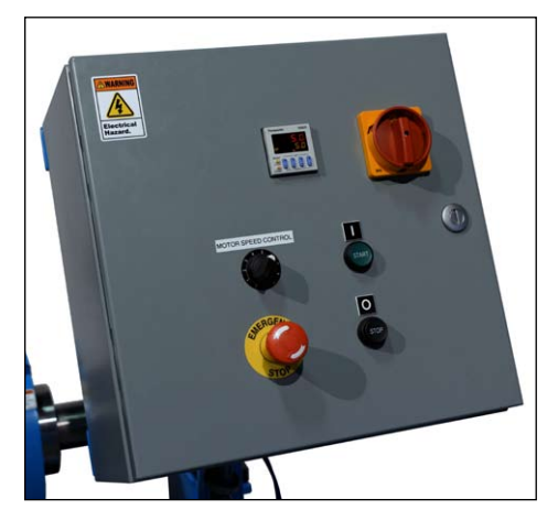
Morse NON-explosion proof AC Control Packages (sold separately) include control box with timer, start and stop buttons, variable speed control from 2 to 20 RPM, emergency stop button and lockable fused disconnect.