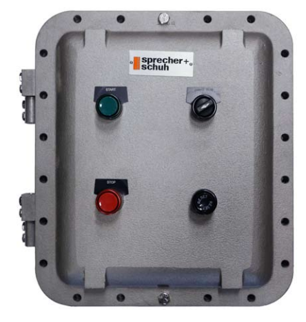
Morse Explosion Proof AC Control Packages (sold separately) include control box with start and stop buttons, and run / jog selector switch.