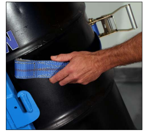
Place loop of web strap onto clevis

2. A variety of drum handling methods can be used to set the drum into the drum holder (images above). Ensure that the drum is fully seated against the back of the drum holder.