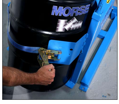
Tighten web strap around drum