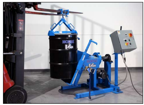
Load drum with forklift, using appropriate drum lifting equipment, such as Morse <u>model 284 Fork Hook</u> and model 92 Below-Hook Drum Lifter.

2. A variety of drum handling methods can be used to set the drum into the drum holder (images above). Ensure that the drum is fully seated against the back of the drum holder.