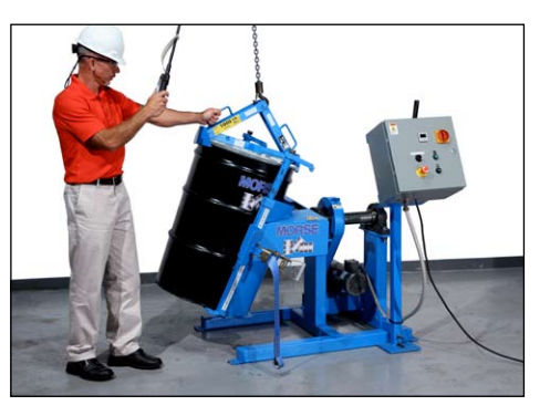
Guide the drum so that it tilts back and seats into the drum mixer as it is lowered.